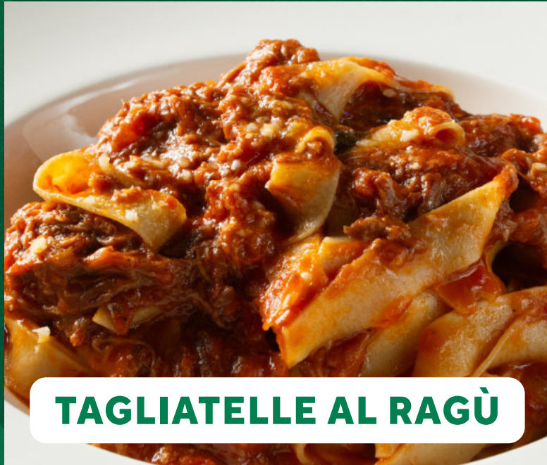
TAGLIATELLE AL RAGÙ

Bologna is famous all around the world for the good food. There are plenty of different local food.