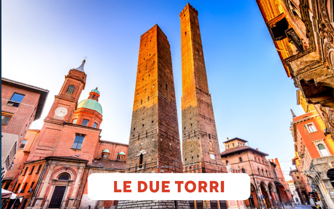
LE DUE TORRI

Bologna is the “city of the towers”, between the XII and the XIII century the number of the towers in the city was more than one hundred, today only 24. The two most famous are “Le Due Torri”, the symbol of the city. You can go inside the tower and after a long climb you could have the opportunity to see a fantastic view of the entire city